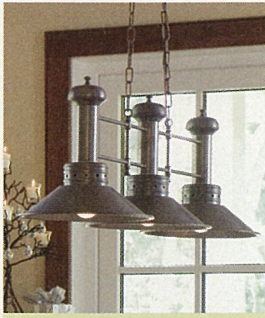
OldPoint Lighting oldpointlighting.com