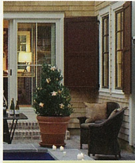
Headhouse Square Shutters headhousesquare.com