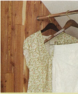
CedarSafe NaturalClosetLiner cedarsafeclosets.com