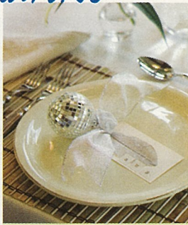
Vietri Tabletop vietri.com