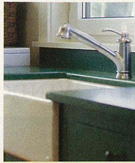
Kohler Plumbing Fixtures kohler.com