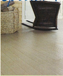
Tendura Decking tendura.com